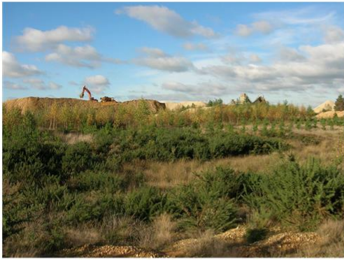
a) Tree planting and natural regeneration at a sand and gravel quarry in the Thames Basin Special Protection Area, Hampshire.