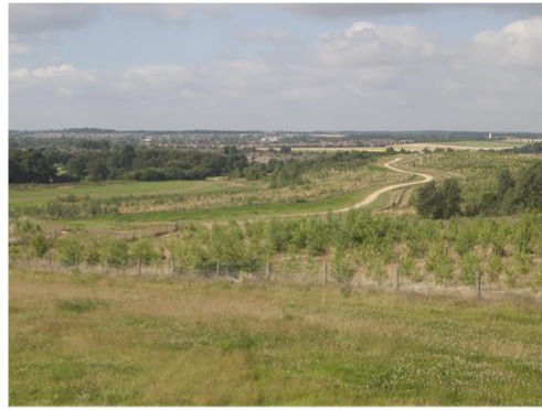
b) Community greenspace establishment at the former Bentley colliery, Yorkshire