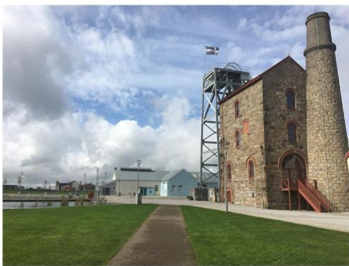
d) Regeneration of South Crofty copper and tin mine, Cornwall, within the World Heritage Site, combines new housing with community facilities.