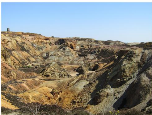
c) The unrestored Parys Mountain copper mine, Anglesey; includes scheduled monuments and Sites of Special Scientific Interest.