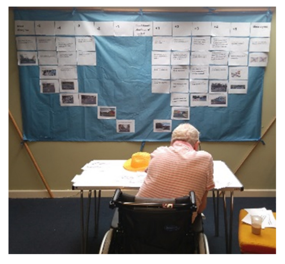
Fig. 1. A participant selecting statements to place in the predefined grid.

The reduction to factors should maintain the maximum amount of variance contained in the original sorts. It should also create a number of factors which are useful in representing the attitudes of the respondents. Ideally a solution will include