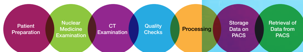
Figure 1: Typical steps involved in the completion of a SPECT/CT examination.

Consideration as to the importance of organisational workflow and the adaptation of new skills following the introduction of new technology, has been studied extensively by Barley 12 and Schoenhofer and Boykin 13 . Both studies link to