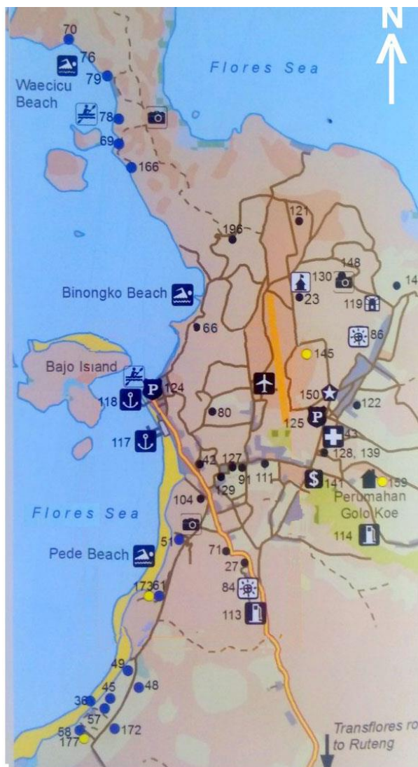
Figure 1 Map of Labuan Bajo research area.

The research was limited to the Kecamatan of Komodo but did not include the islands.