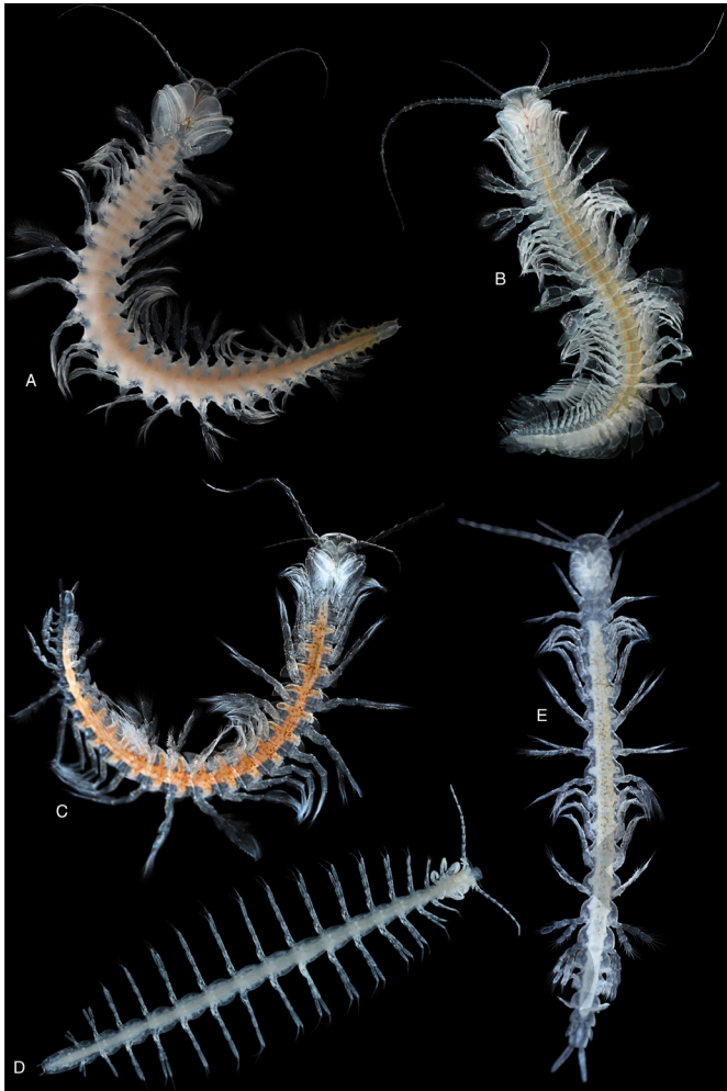
Fig. 5. Remipedes of the Turks and Caicos Islands. A) Godzillius robustus ; B) Kaloketos pilosus ; C) Lasioneectes entrichoma ; D) Micropacter yagerae ; E) Morlockia sp. nov. Images not to scale.

morphology and molecular data limited to one marker (16S rRNA) have been so far inconclusive.