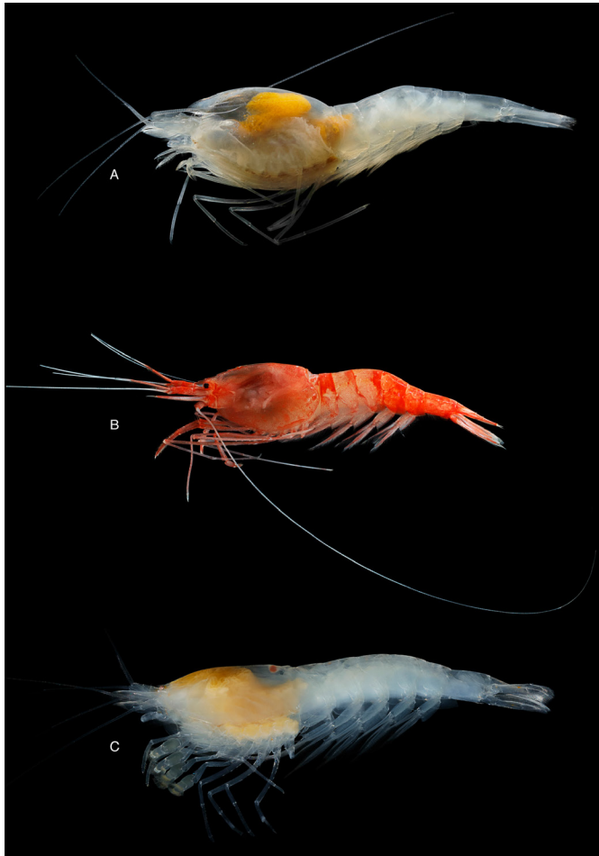
Fig. 4. Anchialine decapods of the Turks and Caicos Islands. A) Agostocaris williamsi ; B) Barbouria cubensis ; C) Typlatya garciai . Images not to scale.

occurs with at least five additional remipedede species (Dan's Cave) (Gonzalez et al., 2013). Currently this is the only remipedede genus known from both the Turks and Caicos and the Bahamas.