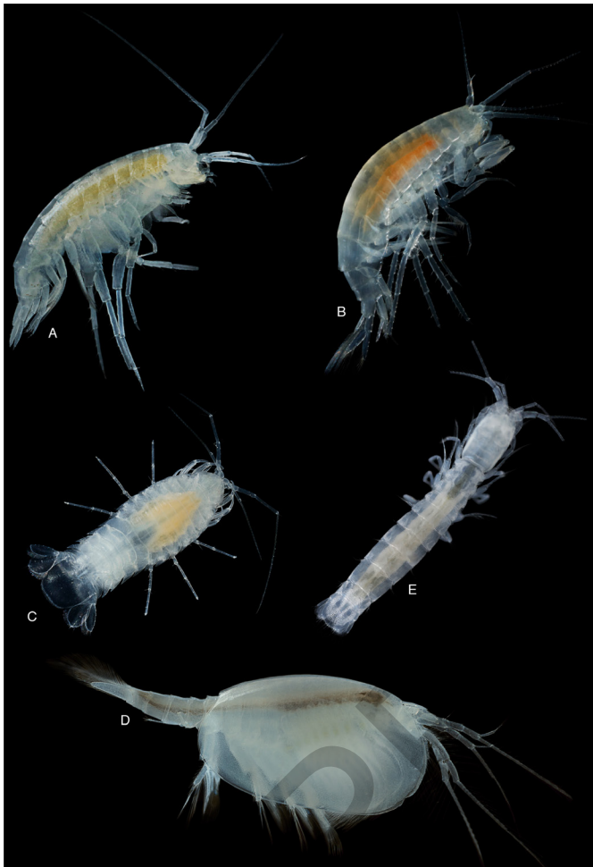
Fig. 3. Assorted anchialine crustaceans of the Turks and Caicos Islands. A) Bahadzia stocki ; B) Spelaeonicippe provo ; C) Bahalana caicosana ; D) Speonebalia cf. cannoni ; E) Stygiomysis clarkeri. Images not to scale.