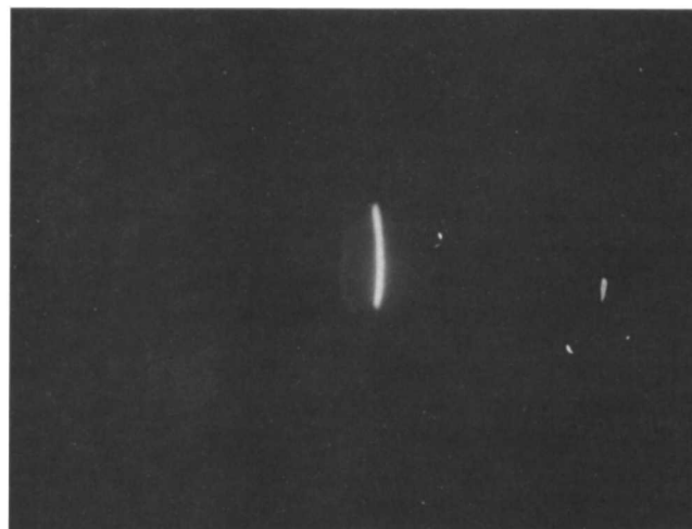
Fig. 2. The image of the filament as it appears on the screen when the projector is turned off.