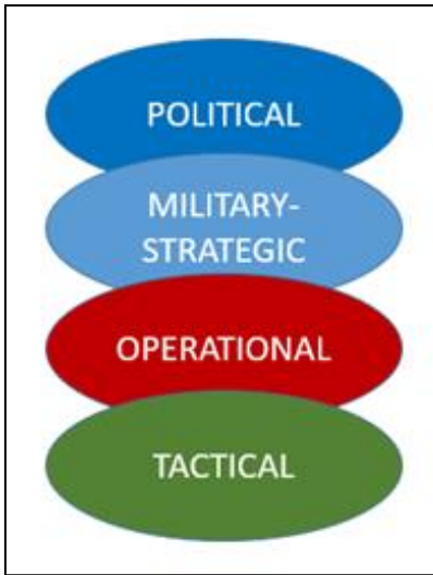
Figure 2: Levels of Command

While some parts are unique to each command level, there needs to be some overlap with the next level to ensure the effective transfer of tasks between the levels. There is also some shared responsibility for those tasks, in the sense of shared duties to see they are accomplished, which, if things go awry in the end, become a shared responsibility , in the sense of culpability .