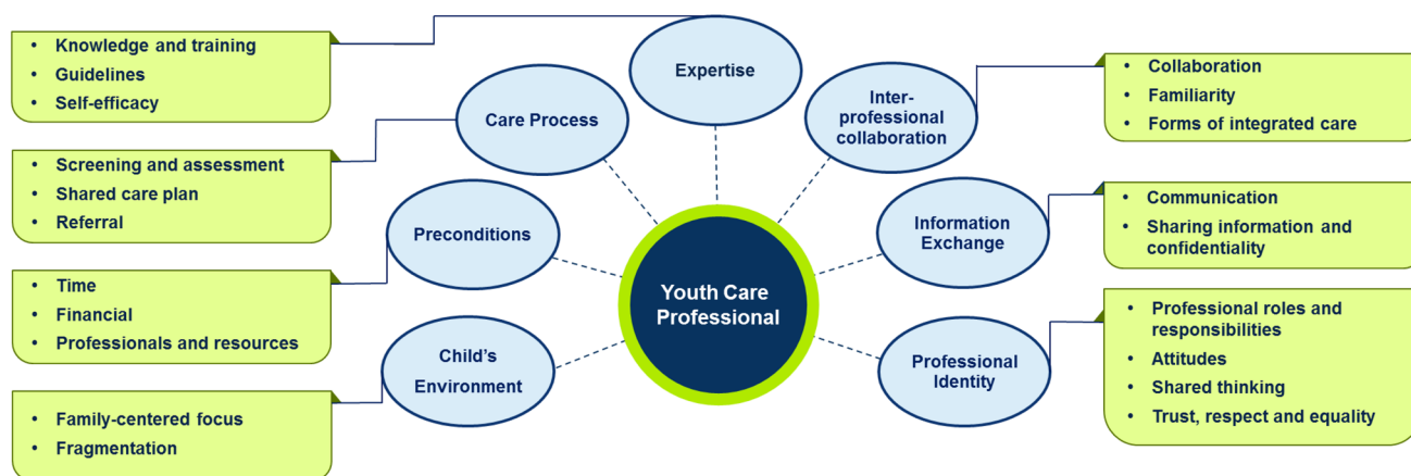
Fig. 2 Thematic overview of facilitators and barriers for Youth Care professionals to provide integrated care