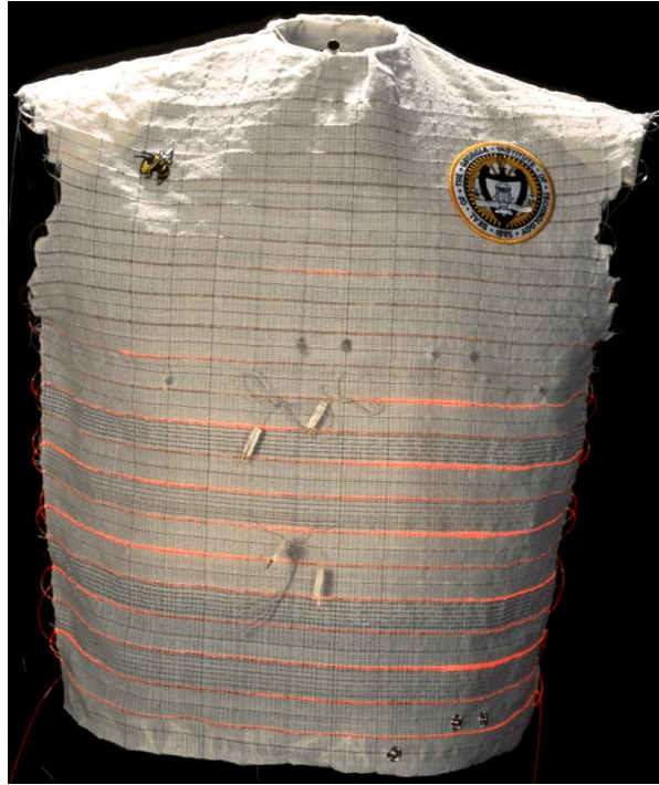
Figure 3. Georgia Tech Wearable Motherboard [18].

Before clothing became a means for self-expression, it protected its wearer from the hazards of the surrounding environment by providing a barrier between the skin and the elements. Traditional clothing is restrained to protecting the wearer from weather, but with the development of smart textiles, the protection capabilities of clothing expand as sensors can detect changes in the wearer's surroundings that result in danger. Sensors made by plastic fiber optics have been used in soldier uniforms to detect chemical and biological threats, above-normal temperatures, and other hazards [20]. Optical sensors operate by measuring changes in light intensity at the end of the fibers. When the light is less intense, the fiber has been deformed. For chemical optical sensors, the fibers are coated in layers that react with specified chemicals, the reaction causes the fibers to degrade, changing the intensity of light transmission.