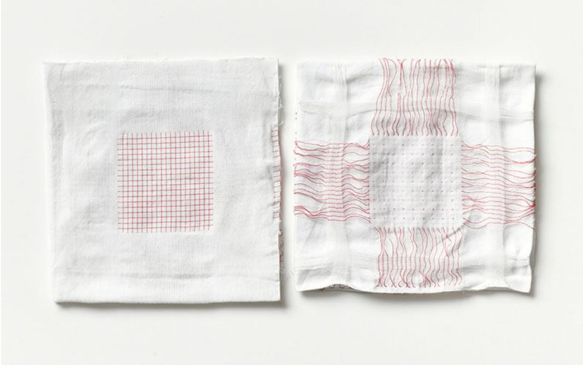
Figure 1. Sample touch sensor weaved by Google ATAP in Project Jacquard using conductive threads and 3D weaving [5].

In the process of knitting, yarns are arranged into rows of consecutive loops. It is possible to create more complex patterns by changing the sequence of individual stitches. Industrial knitting machines can produce three-dimensional textile architectures as well on circular weft-knitting machines [6]. One of the major advantages of weaving and knitting processes is the ability to make large-area textiles quickly and autonomously. Industrial weaving machines can make more than ten million square meters of fabric in a year [7]. Woven fabrics and knitted textiles are comfortable too as they are breathable and lightweight. Woven and knitted textiles both have distinct characteristics though. Woven textiles are durable and maintain their designated shape better than knits. As a result, the placement of conductive yarns can be more precise, and the yarns can be placed more densely together, creating more integrated components in a set area. On the other hand, knitted fabrics can be easily stretched, so they are