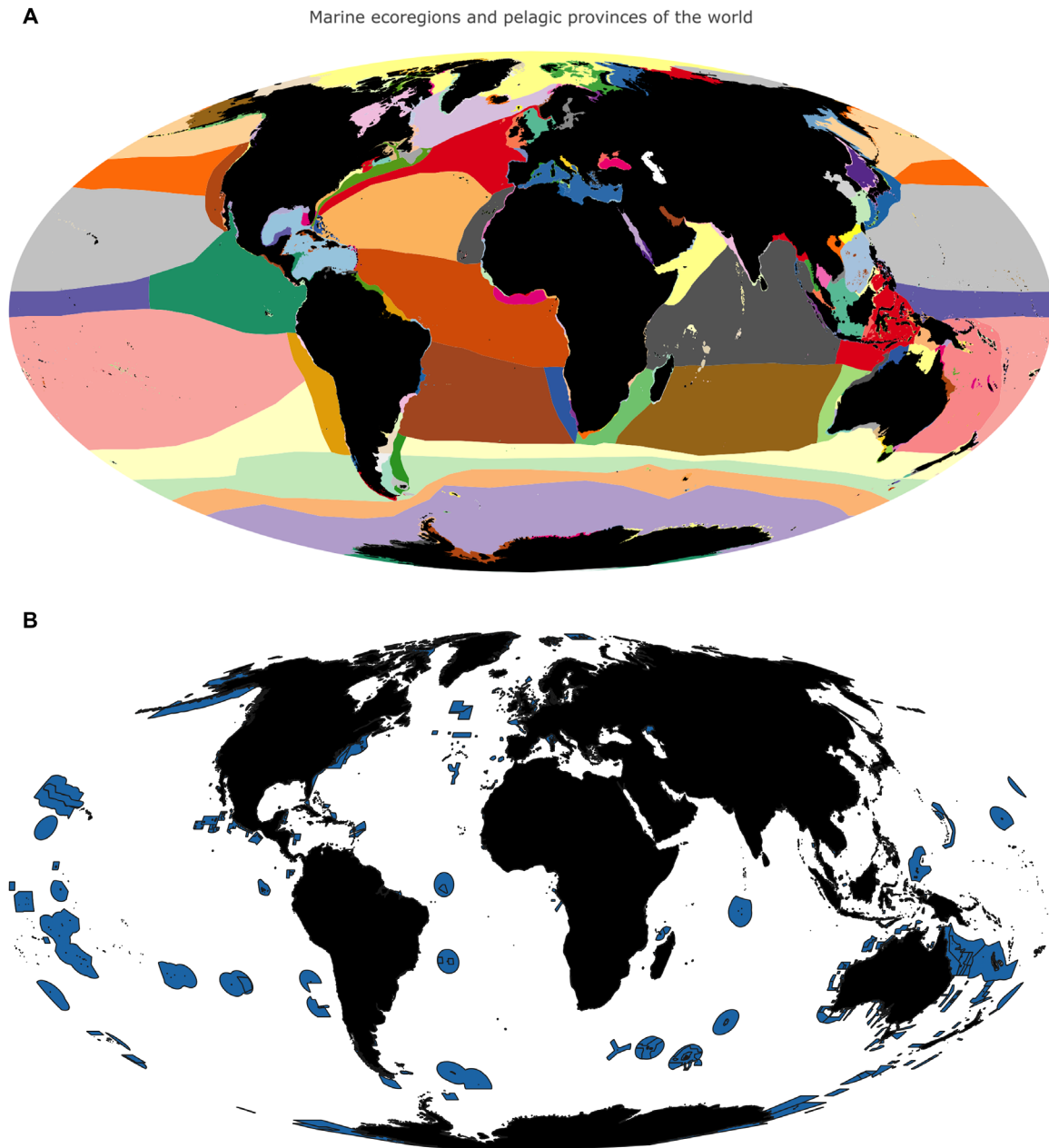
Fig. 3. Coastal ecoregions, pelagic provinces, and marine protected areas of the world oceans. (A) Coastal ecoregions and pelagic provinces. (B) Map of marine protected areas.

population (72), and management of this habitat could be supported under the OECM umbrella as megafaunal landscapes in that part of the breeding tiger population, especially in India, that occurs outside formal protected areas. The payoff for climate stabilization is dramatic: An earlier study showed that forested areas that contain tigers have three times the carbon density compared to forests and degraded lands where tigers have been eradicated (71). Restoration in tiger habitat and other megafaunal landscapes could center on protecting remaining fragments of natural habitat, reconnecting and buffering them by restoring degraded lands, thus aligning with the Bonn Challenge that seeks to restore 350 million ha of forest by 2030 (73). The same rationale could be used to extend protection in high-carbon density