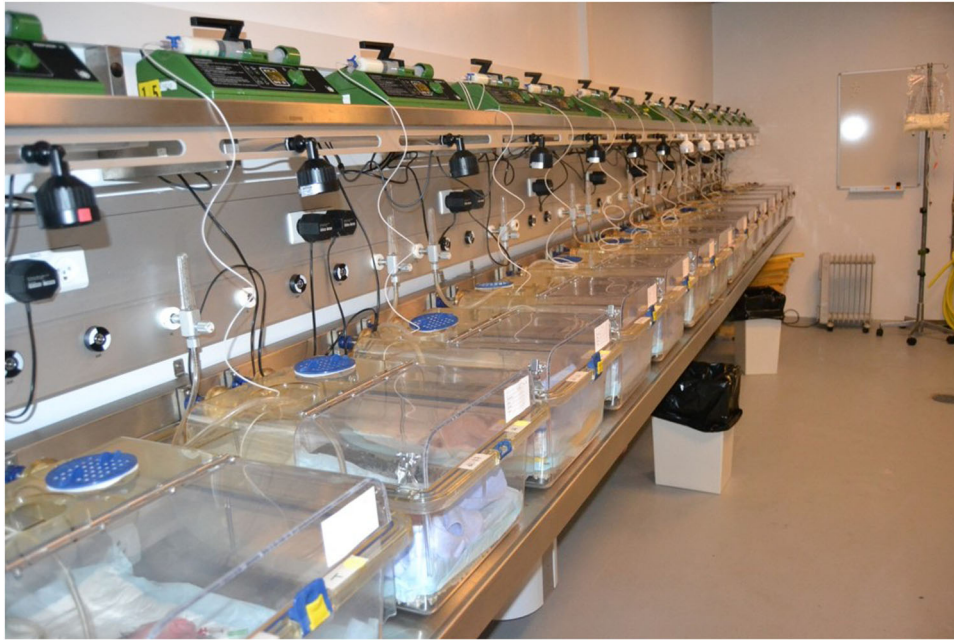
Fig. 1 The preterm pig laboratory. Piglets installed in incubator-like boxes and connected to feeding machines.