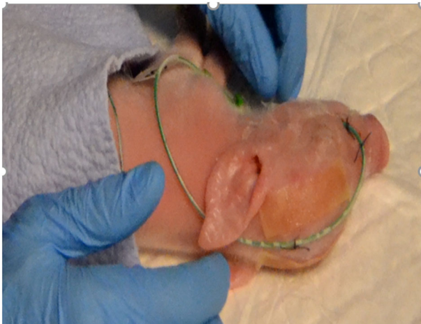
Fig. 3 Individual care in the pig laboratory. A researcher cares for a premature piglet in the pig laboratory. The green line provides the piglet with enteral nutrition.