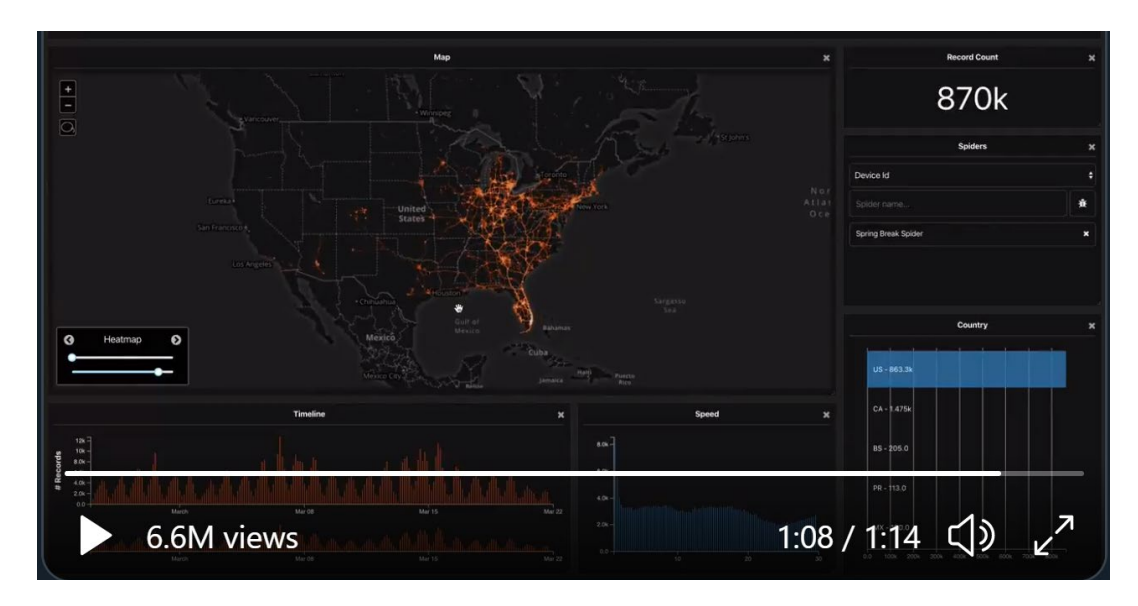
Figure 3.5 demonstrates the use of a "spider query" where the

devices that were targeted inside the geofence traveled to.