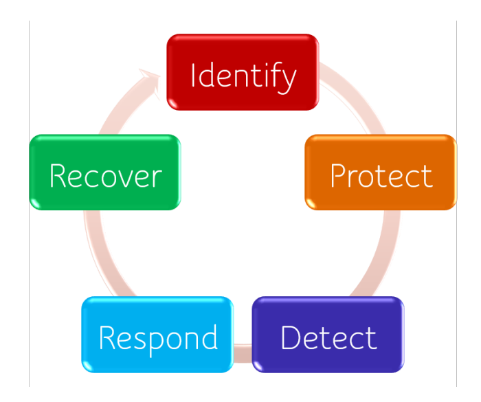
Figure 3.2: NIST Cybersecurity Framework Version 1.1 (NIST, 2019)

As demonstrated with the hacker methodology the NIST framework will be used here to display the potential security benefits posed by geofence encapsulation. The same format is applied: Step> Tool Application> Current Application> Potential Risk> Potential Benefit.