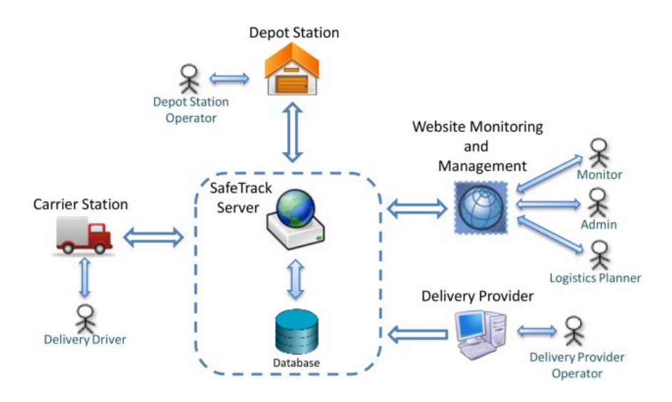
Figure 3.3: Supply Chain Solution

Geofencing is used to assist the algorithm in preforming decisions to reroute cargo when detours or slowdowns arise.