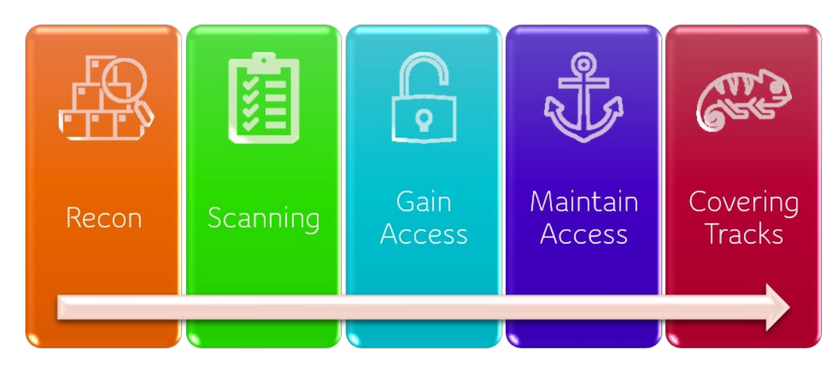
Figure 3.1: Rendition of the Hacker Methodology