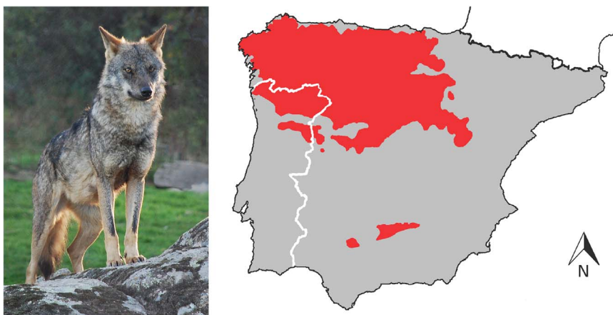
Fig. 1. A specimen of Iberian wolf showing the characteristic black marks on the front legs. Current geographical distribution of the subspecies.