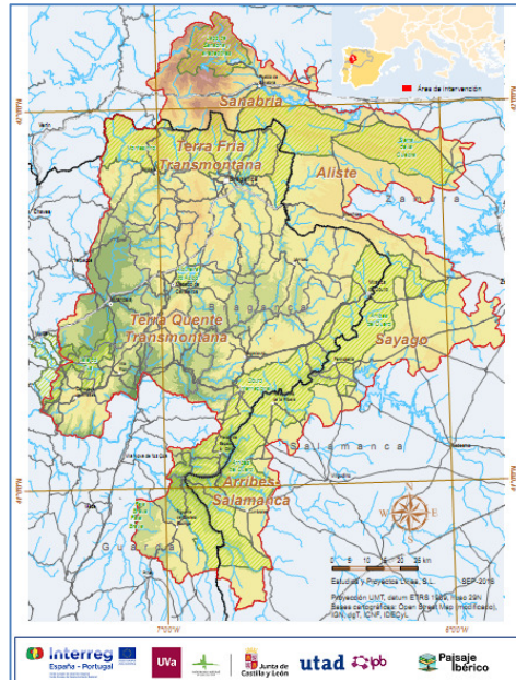
Figure 2 : Regions of the Iberian Meseta.

The Iberian Meseta reserve is integrated in the Portuguese regions of Terra Quente and Terra Fria in the Northeast Transmontano, and the Spanish Municipalities of Sanabria, Aliste and Sayago (Fig. 2). These zones have their own management processes, dependent on the region, which must be articulated depending on whether they are natural protection areas such as the listed natural parks or historical zones of the various localities. The different natural landscapes of the Iberian plateau united by the banks of the river Douro and by a fluvial network provide an integrated articulation of the entire frontier region.