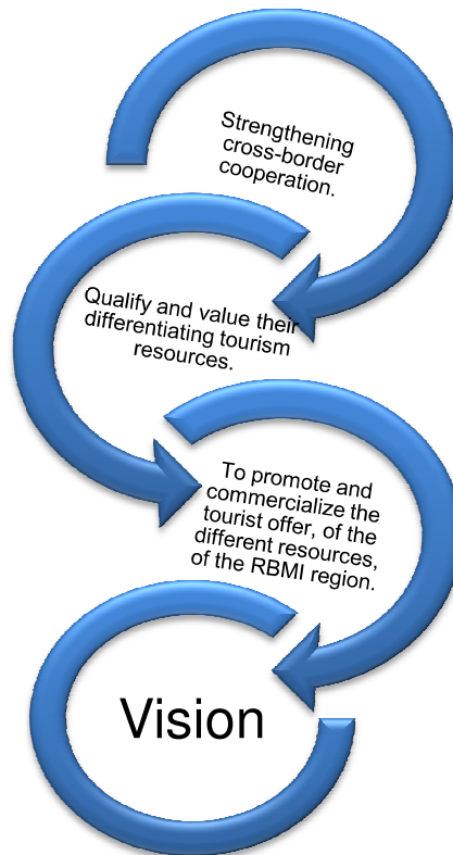
Figure 4: RBMI Vision

The 'Vision' is essentially based on 3 pillars that intends to support the achievement of the strategic objectives that are proposed; and can be observed in the figure below.