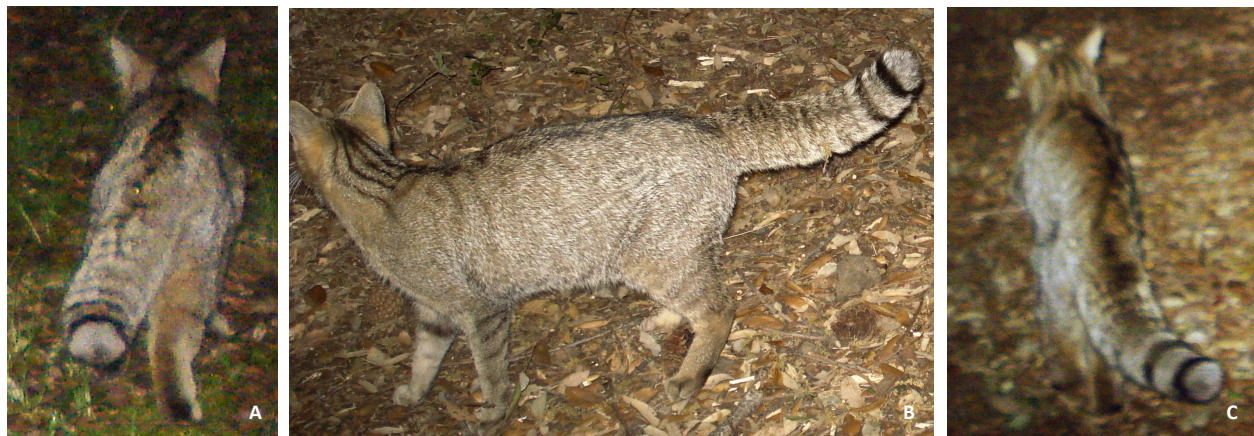
Image 1. A & B—European Wildcat photographed at Mt. Etna on 26 May and 15 June 2009 | C—European Wildcat photographed at Mt. Etna on 10 June 2018.

1A) this Wildcat was clearly identifiable by the absence of the typical black-tipped tail of the European Wildcat (Ragni & Possenti 1996); its tail showed only a clear white ring (Image 1B). In addition, the shape of the dorsal stripe aided to confirm its recapture. During the same survey, two additional photographs of this individual were obtained at two other camera stations. Collectively, three photographs at three neighbouring camera stations were recorded. During the camera trapping survey conducted in 2018, this individual Wildcat was recaptured on 10 June 2018 at one camera station (Image 1C), relatively near to where it was captured during the 2009 survey. The mean distance