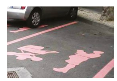
[9] Pink parking, Avezzano, Italy [10] Changing baby room sign, [11] Keep out of reach of children,

To convey this message, a little girl is pictured reaching up to take the product in question, which is positioned on a shelf above her. The child's action reaffirms that the product is aimed at female consumers (the symbol recurs, in a similar if not identical form, on other products of different brands) and implies the role that she will assume when she grows up. The little girl is depicted wearing a short dress, with pigtails and holding a doll, a key reference that symbolises learning of the care roles that we have seen to be the female domain.