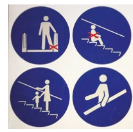
[8] Safety signs on escalators, Italian public signage system

Cases of signage featuring females also include those that use the colour pink to mark parking spaces reserved - as reported in a daily newspaper article about the creation of the first pink parking spaces in the municipality of Sesto San Giovanni - for "new mothers", with babies up to 18 months, taking for granted that the role of carer falls exclusively to the mother. These parking spaces are also signed, in other localities, through application of pictographic signs representing a female figure pushing a baby carriage ( image 9 ).