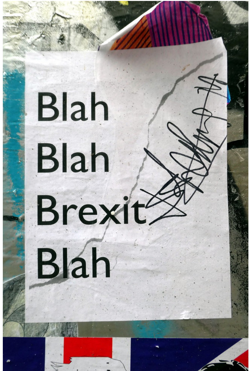
"street art, Shoreditch"

EU nationals are increasingly asked to prove their right to stay in Britain in the context of a continuous shifting of goal posts for lawful migration. What the hostile environment does is to make everyone feel precarious, including individuals and families who have resided in Britain for decades. It constructs all migrants, including EU citizens, as potentially 'illegal'. But this is not only about 'foreigners'. The Windrush scandal shows the contempt of the UK government for those who came from the former colonies as British subjects, a contempt no doubt deeply rooted in colonialism and racism. The ease with which the UK government has turned the EU citizens living in the UK into leverage in the Brexit negotiations with other European member states is also a testimony of the extent to which the hostile environment is pervasive and operates as a logic of governance. The Windrush scandal and its deep rooted links with British colonialism is another illustration of this racialised modus operandi that reshapes the rights of citizens and immigrant alike and the relationship between the state and its subjects, redefining the meaning of citizenship and belonging in the process.