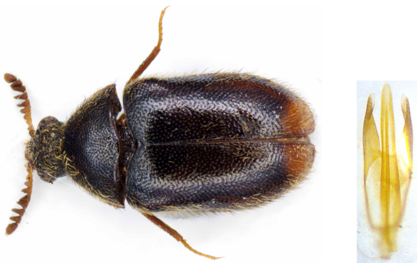
Figs. 3-4: Trogoderma stachi Mroczkowski, 1958: 3- habitus, dorsal view; 4- male genitalia

Distribution. Species known from Brazil, new for Argentina.