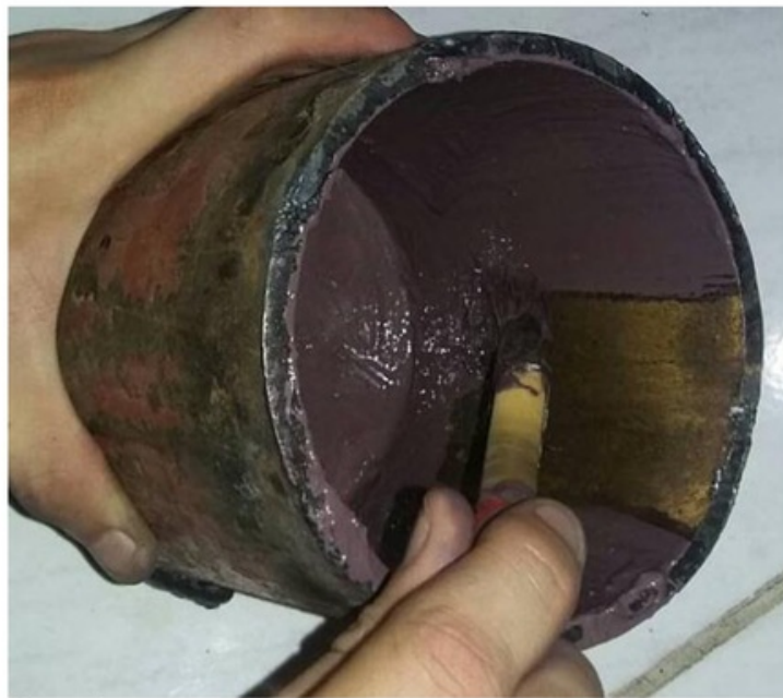
Fig. 1. Steel crucible coating.

To prevent iron diffusion to the aluminium melt, the inner wall of the steel crucible used in this work was coated prior to melting process (Figure 1). Iron diffusion to the aluminium should be prevented since iron deteriorates mechanical properties of aluminium alloys [3].