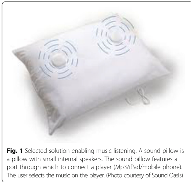
Fig. 1 Selected solution-enabling music listening. A sound pillow is a pillow with small internal speakers. The sound pillow features a port through which to connect a player (Mp3/iPad/mobile phone). The user selects the music on the player.

Insomnia, sleep disturbances and sleeping problems refer to a broad understanding of the disorder. Symptoms include difficulties initiating and maintaining sleep.