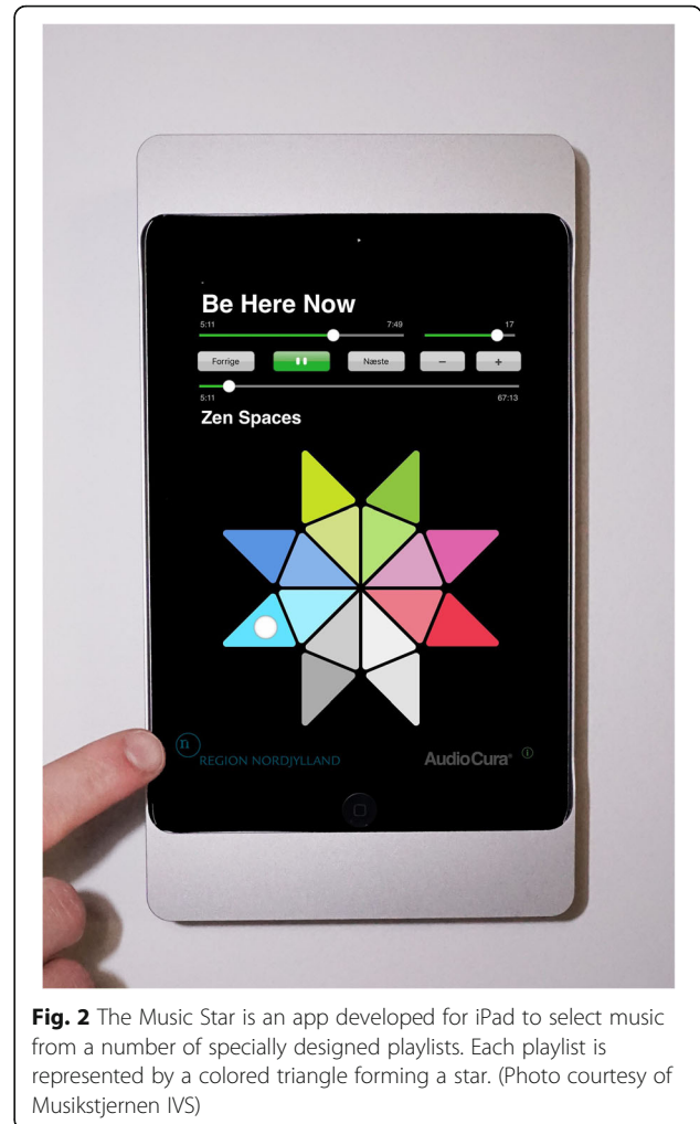
Fig. 2 The Music Star is an app developed for iPad to select music from a number of specially designed playlists. Each playlist is represented by a colored triangle forming a star.

The black element in the bottom left of Fig. 3 illustrates the intervention given as an option to the waitlist control group. The participants may take home the sound equipment for 4 weeks. There is no data collection involved. This has been added to the study for ethical reasons and to limit drop out from the control group [16]. The schedule for the trial is described in the SPIRIT flow chart (Fig. 4) and the dimensions of the study protocol have been described, adhering to the SPIRIT checklist (Additional File 1).