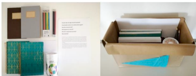
Figure 2: Cultural probe package for the diary study.

In the diary phase, we obtained rich qualitative insights into the families' current practices around mobile device use and how that use shaped family relations. In this part of the study, we designed a self-reporting diary probe framed as a cultural probe [17]. The probe consisted of diaries for each family member, blank papers, pencils, colour pencils, and printed instructions and inspirational sentences (see Figure 2).