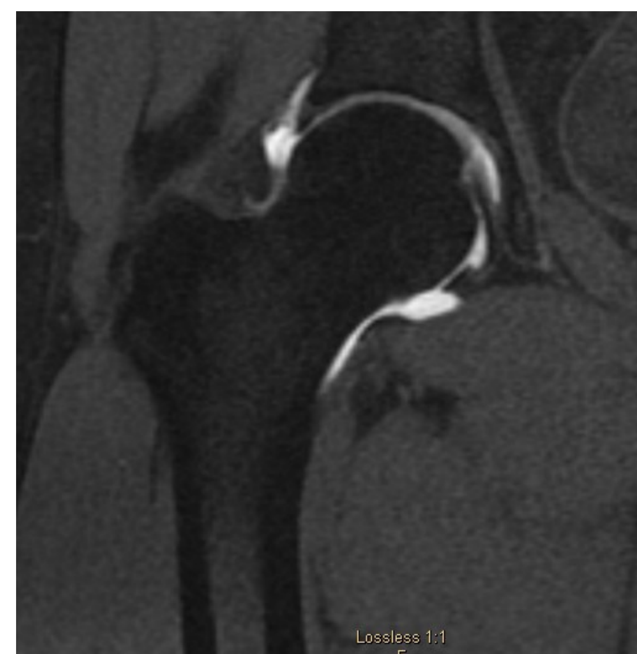
MRA prior to PRP

A 47-year-old active male presented with 2.5 years of right hip pain suggestive of labral pathology. Ice, heat, celecoxib, ibuprofen, diclofenac gel, and physical therapy provided minimal relief. A diagnostic intra-articular bupivacaine injection resolved the pain. A subsequent MR arthrogram revealed a non-displaced tear of the right anterior superior acetabular labrum.