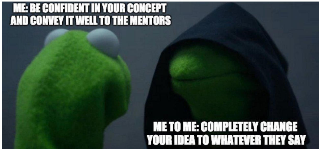
Image 1. A meme shared on an event Discord chat.

Participants were well aware of the influence and authority exuded by mentors. Circulated through event Discord and Slack chats, comments or memes, like the one above, expressed the tendency for participants to drop their ideas completely in preference for a mentor's. For events where the mentors would go on to serve as judges, the benefits of adopting their advice were obvious. Much like the real world, it's often easier to just take the advice of your manager than risk a threat to your compensation. For other events, with a fairer division of interest, adopting mentor advice was still seen as a rational route, reinforced by a mentor's meritocratic elevation. In reality, sentiments like the one above were expressed tongue in cheek. Few, if any, teams were dropping their ideas outright. Instead, the tendency across events was for mentors to steer projects towards a proclaimed viability, in line with whatever their personal vision of viability meant ---- profitability, efficiency, or sustainability being the most common formulations. Reflecting back on the neoliberal management styles that now dominate research universities, it seems only congruous that these same managerial practices are adopted and