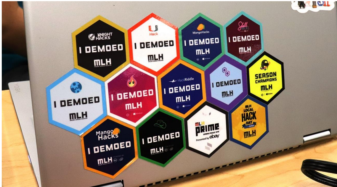
Image 2. MLH Stick-badges, earned from ‘demoing’ at official events.

The gamified nature of events further lends itself to the allure of these exceptional environments and deeply imbues events with a sense of ludic, or playful, activity. Following our earlier discussion on the staging of events and the suspension of reality (Gómez-Cruz & Thornham, 2016), the vibrant and carnivalesque atmosphere of events lends itself to a feeling of the extraordinary. Indeed, MLH events are open about their flirtation with playfulness, including secondary challenges in the form of karaoke contests, cup-stacking, and miscellaneous mini-games for participants to blow off steam. MLH and event organizers are dutiful in their attempts to make events fun and to produce a pleasurable experience for participants, knowing that the more pleasurable event will attract more attendees into the future. In promoting a marathon-type event, characterized by sleep deprivation and caffeine stimulation, events take advantage of a range of perverse pleasures. One of my interviewees recounted his first hackathon experience, where he consumed so much caffeine that he became sick and was ultimately unable to complete his project. This didn't deter him forever, though. He was back at it the next year, ready to