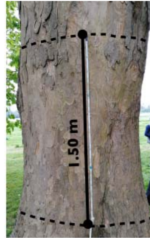
Fig. 1. The investigated tree.

However, if the weak scattering assumption is no longer valid, it is still possible to obtain reliable information regarding the presence, position and approximate shape of targets [30].