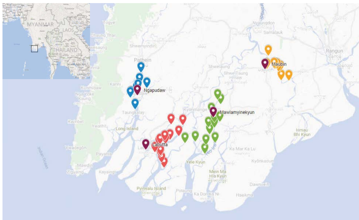
Figure 3. Location of townships and villages surveyed in the Ayeyarwady Delta

Source: https://earthshots.usgs.gov/earthshots/ . The map showing village locations was based on Google Maps