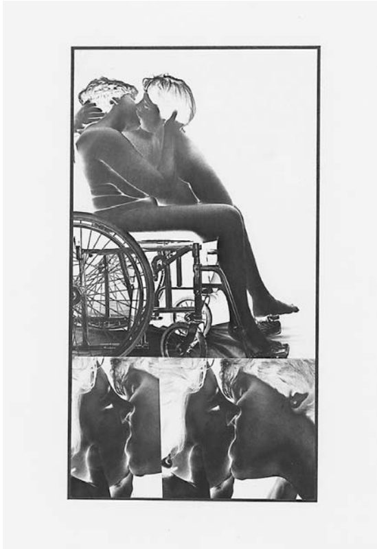
Untitled image tagged with the terms “art,” “erotica,” and “labia.” Tee A. Corinne, image courtesy of the Lesbian Herstory Archives photo collection

“I had absolutely no problem with this because there are no recognizable women in it. Those images are well known. . . . We have her permission to use them; nobody’s going to make a big deal out of it. And, yes, it’s art. You know, I called it “erotica”—why didn’t I call it “sexuality”? At some point I just need to get stuff up [online], and I can’t spend more time waiting for inspiration. If changes need to be made, that will happen. I think that discussion will come; clearly, we’re having one now. And maybe you will make me aware of something, or I will make you aware of something, and something changes in the metadata. I have no problem going in the system and adding or taking something away in terms of description. The more I work with it, the more that actually happens, because I realize that I can be more exact, I can be more precise. It will be better, it will be easier to use, more informative. 37