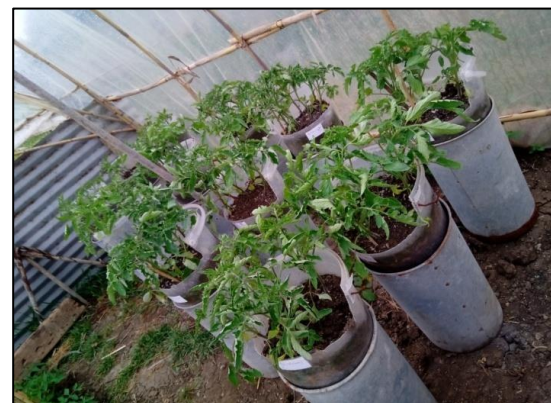
Figure 2. Layout of the experiment

Seeds of tomato cultivars (Rio Grande) used in this study were obtained from a local farmer, and were sown on 16 February, 2019 in separate pots (thirty seeds were planted in the pot) having a mixture of soil and sewage sludge. The experiment was laid out in a Completely Randomized Design (CRD) with three replications. There were three treatments consisting of T1 (25 % sewage sludge), T2 (50 % sewage sludge), T3 (75 % sewage sludge) and T0 (Control, no sewage sludge) (Figure 2).