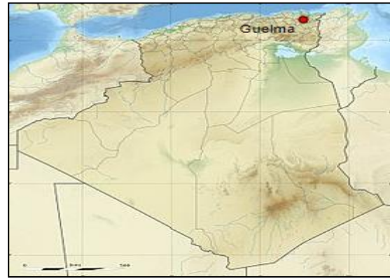
Figure 1. Map of Guelma city, Algeria

The pot culture experiment was carried out during 4 months (from 16 February 2019 to June 18 2019), at an experimental green house built in the locality of Salah soufi, Guelma, situated in north-eastern Algeria, about 65 kilometres from the Mediterranean coast. It is a large agricultural land at 290 m (above sea level.). The climate is sub-humid with an average precipitation of 600 mm/year and a temperature of 18.5 °C. It is a fertile area due to Seybouse river and to a big dam ensuring irrigation of a vast perimeter of 9650 ha (Figure 1) (Kachi et al., 2016). The sludge samples used in this experiment were obtained from the sewage treatment plant of Guelma City.