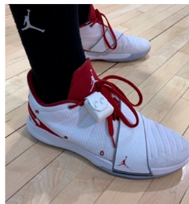
Figure 2. Positioning system (IPS) sensor placed in the protective rubber sheath on the athlete's shoelace.

Participants wore the IPS sensor (ShotTracker, Mission, Kansas, United States) fastened to the shoe in a protective rubber sheath, looped around the shoelace (Figure 2). In unison with the IMU data collection, monitoring began when the athlete took the court for pre-practice warm-ups, where the sensor on the shoe could be synchronized with the nodes on the ceiling, orienting the unit on the area of play. All data were analyzed and exported using the ShotTracker software (ShotTracker, Mission, Kansas, United States). The variable of interest was Distance traveled (Distance) throughout the duration of practice.