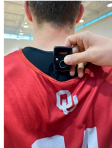
Figure 1. Measurement unit placed in the athlete's supportive garment.

note: a_Y = anteroposterior acceleration; a_X = mediolateral acceleration; a_Z = vertical acceleration.