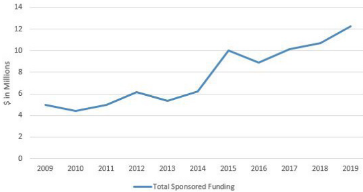
Figure 1: Sponsored Funding, 2009-2019

Sponsored revenue is received from both public agencies and private partners. The funders also represent a mix of local, state, national, and, to a lesser degree, international work.