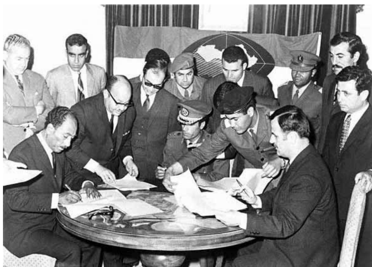
Syria's President Hafez al-Asad (sitting on the right side) signing the Federation of Arab Republics in Benghazi, Libya, on April 18, 1971 with President Anwar al-Sadat (sitting left) of Egypt and Colonel Muammar al-Qaddafi of Libya (sitting in the centre). The agreement never materialized into a federal union between the three Arab states.