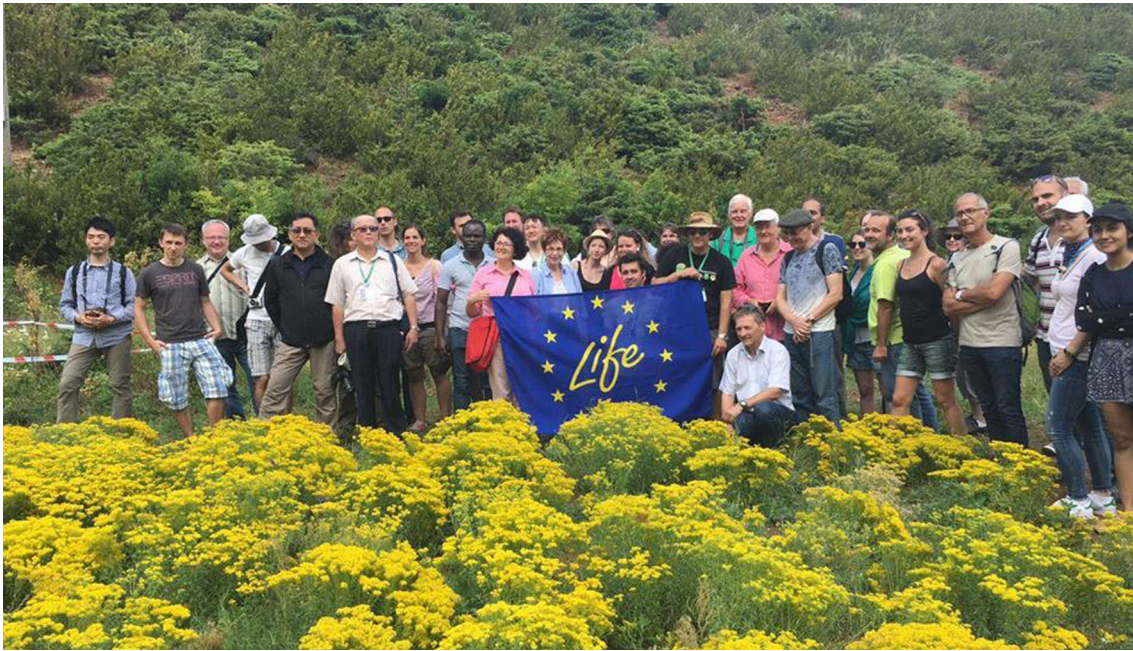
Fig. 2 Visit of the first full-scale nickel agromining field trial in Europe in Pojske (District of Pogradec) by conference delegates during the mid-conference trip (June 8, 2017)

transporter in the Ni-hyperaccumulator Alyssum inflatum (Brassicaceae), it is concluded that high cytosolic \text{Ca}^{2+} is an important parameter that results in Ni tolerance. An investigation of the mechanisms involved in Mn hyperaccumulation by Phytolacca americana suggests that this trait may be a side effect of rhizosphere acidification as a phosphorus-acquisition mechanism, rather than an adaptation to high soil Mn per se (DeGroot et al. 2018). The final article in this section reports on a study on the interaction between Pb uptake and Fe nutrition in Matthiola flavida (Brassicaceae), a facultative Pb hyperaccumulator from Iran (Dehno and Mohtadi 2018). All these studies give a better understanding of the mechanisms of metal hyperaccumulation and show how much this trait is related to the homeostasis of essential nutrients (such as Ca, P, Fe).