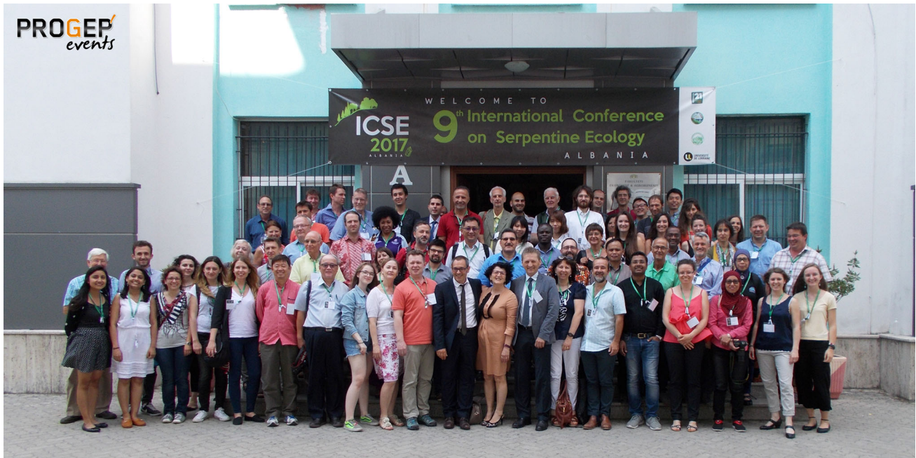
Fig. 1 Group photograph of the delegates of the 9th ICSE in front of the Conference Room Building at the Agricultural University of Tirana on the first day of the Conference (June 5, 2017)

ness of circumboreal ultramafic ecosystems in the Northern Hemisphere (Teptina et al. 2018), the specificity of the communities of lichens in ultramafic environments (Favero Longo et al. 2018) and the specificity of the associations of organisms present in the biological crusts on ultramafic vs. non-ultramafic soils (Venter et al. 2018).