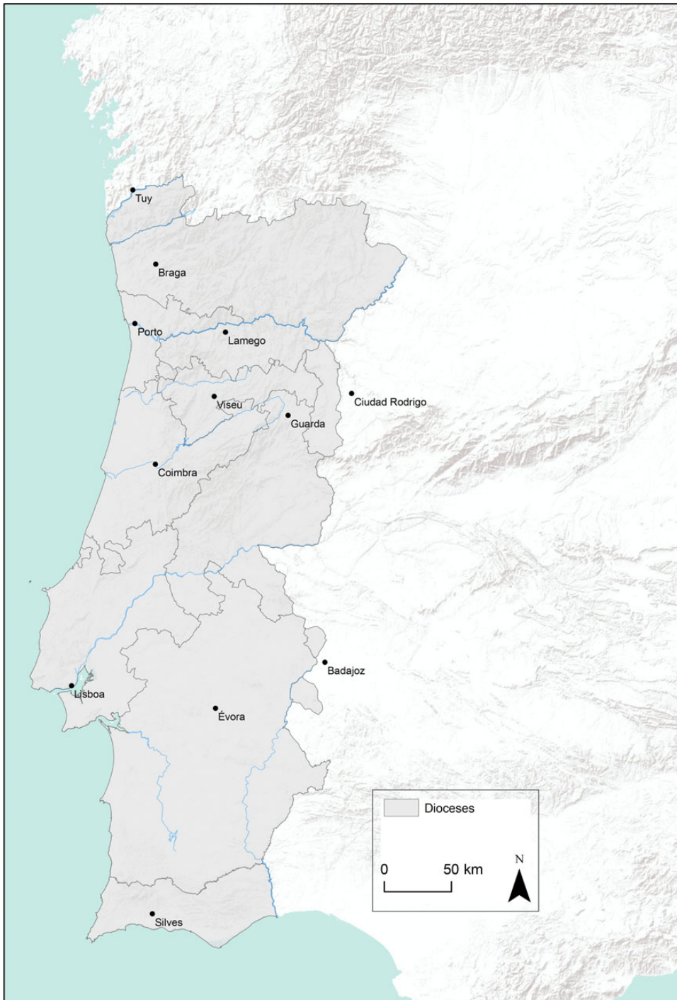
Figure 1. The dioceses in Portugal, c. 1320 (approx. limits). Cartography by Cláudia Viana.