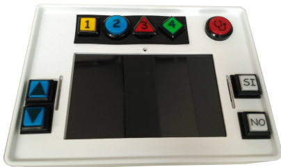
Fig. 3. Remote control used to interface the robot

allow collecting the results of the tests, including session recordings. Hence, all the configuration information and the results of the session travel through these channels.