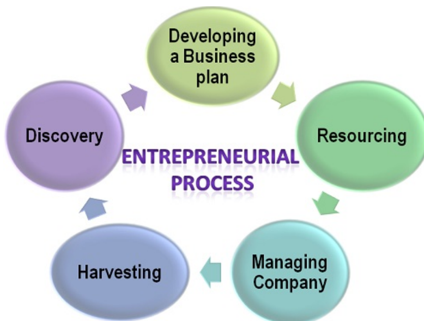
Figure 1. Five Stages of an entrepreneurial process