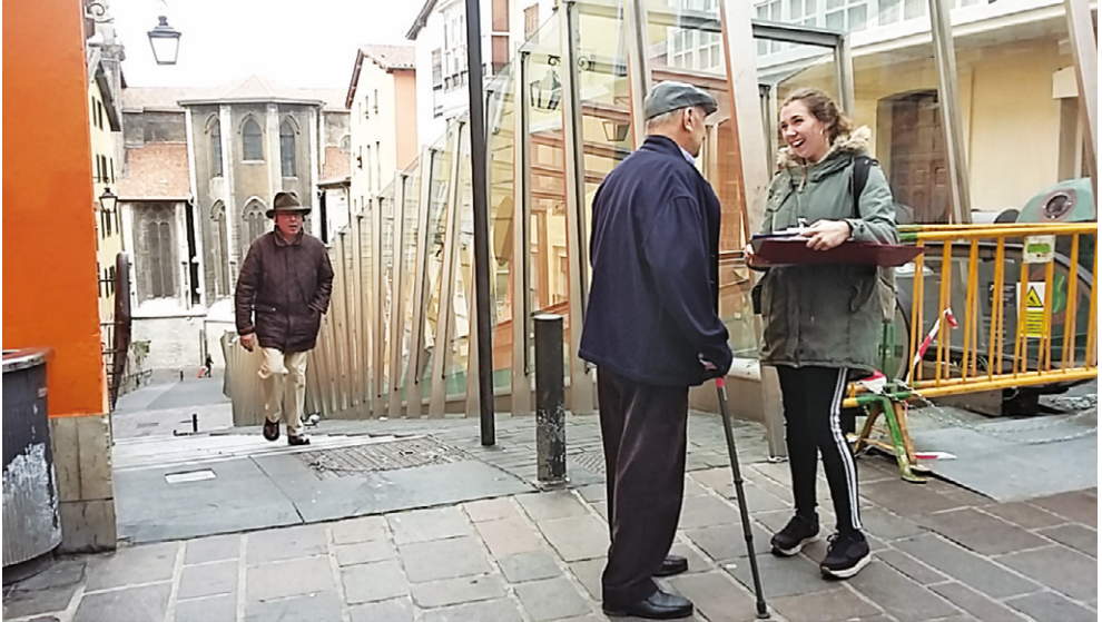
Fig.02 Monitoring movement of citizens and surveying users of the vertical mobility devices within the MOVE AGED Project. M. Serrano

These elements, which have witnessed a rapid development in recent decades, are widely used by the population, who see them as an invaluable aid in getting around easily in their local urban environment. In Spain, for instance, more than 400 complete infrastructure items (some of them composed of several individual elements) have been developed in the last two decades (Toda, 2015).