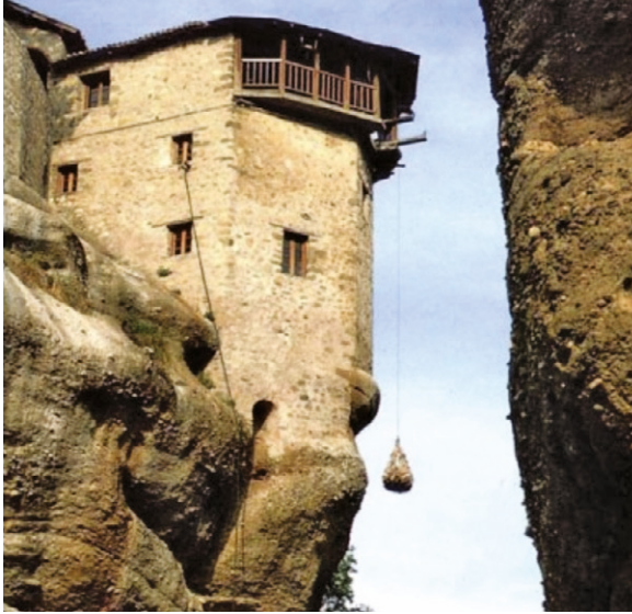
Fig.01 The Greek monasteries of “Metéora”, built on the summits of rock formations average 300 mt in height, offer an archetypal example of mechanical vertical mobility: “before the 1920s ascending the rock columns involved the perilous enterprise of climbing ladders or being hauled up by ropes and nets” ( https://www.britannica.com/topic/Meteora ). Av. at http://www.monastiria.gr/meteores-monastere-de-barlaam/?lang=fr .

ty, both within single historical buildings and within the open spaces of historical settlements. Gaining access in a safer and more comfortable way is certainly a prerequisite for the sustainable use of architectural heritage, the social and economic dimensions of which go further than simply overcoming physical or cultural limitations and regard different kinds of user. On the one hand, vertical mobility improves the quality of life of residents and local communities and facilitates social inclusion; on the other hand, it can encourage cultural tourism and bolster the local economy. In any case, vertical mobility takes on a particular importance when considering the ageing population (as will be outlined below).