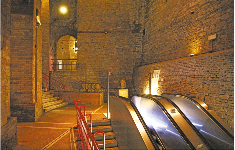
Fig.04 Escalator installed in the 1980s inside the ancient Rocca Paolina in Perugia.

According to Juhani Pallasma the multisensorial experiences, when in sequence, lead to a fusion of the qualities of space, matter and proportions (Pallasma, 2005), so as to generate a “polyphony of senses” (Bachelard, 1957). Walking while thinking, an image we have inherited from the agora of ancient Greece (Solnit, 2001), is an experience that can be relived through a stroll along anchored paths. The reference is now to the unanchored urban promenade of the flaneur by Walter Benjamin (Benjamin, 1982), regarding the subsequent involvement of direct experience, which allows us to rediscover a new lexicon dictated by discovery (Burckhardt, 1997) and the opportunity to lose ourselves (Augè, 2009).