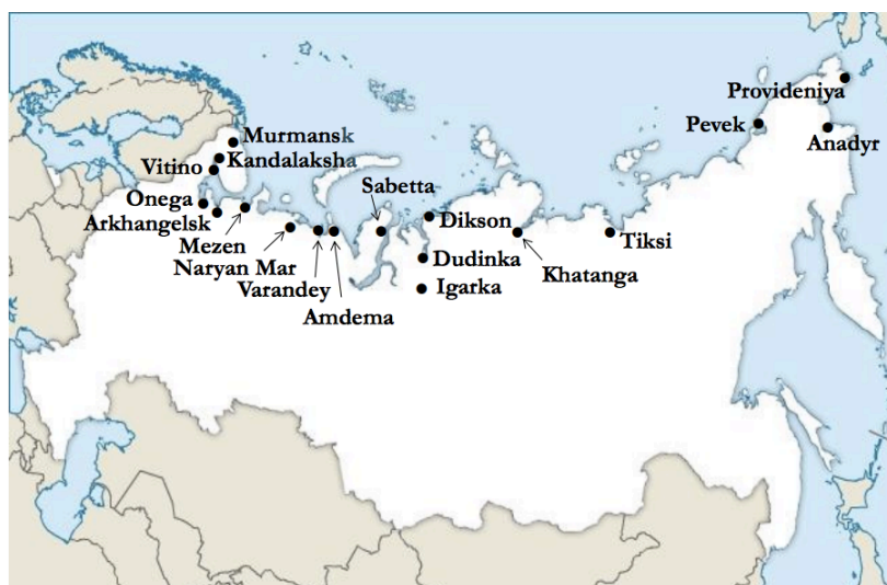
Figure 1, Russian Arctic ports

The development of the NSR's infrastructure and supporting services is included in the Transport Strategy of the Russian Federation up to 2030 (see Shcherbanin, 2013 and www.government.ru/en/dep_news/13191/ for details). Furthermore, there is a plan to develop Murmansk into a major transport hub, with planned construction of oil and coal terminals, container terminal, facilities to handle fertilizers, and a new railroad ( www.rosmorport.com/mur_developmentofports.html ). Planning is underway to develop Dvina Gulf (located on the White Sea 55 km north of the city of Arkhangelsk) into new deep-water seaport, operating year-round and servicing vessels up to 100,000 dwt and transporting up to 30 million tons of cargo annually by 2030 ( www.rosmorport.com/arf_developmentofports.html ). Container shipping is seen as a key component of the new port.