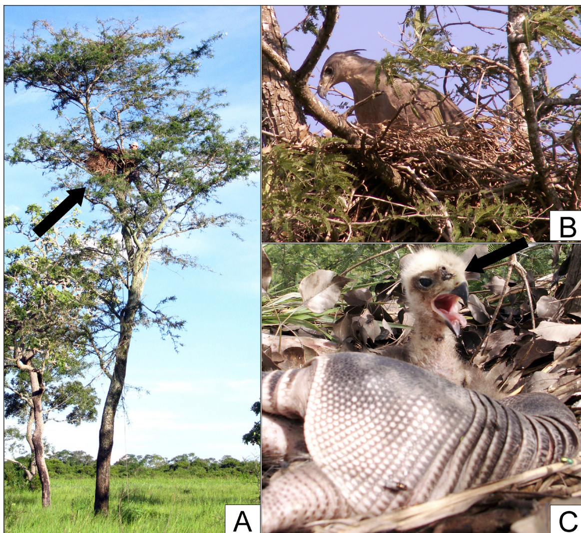
FIGURE 2. Nest tree (A), adult female at nest (B) and nestling (C) of Crowned Eagle. Note botfly on nestling's head

G. between the entrance of Estancia Cutal and the road San Pedro – Trinidad. Vidoz reported an individual 5.6 km south from this place in 29 July 2005 (Maillard et al. 2008). In September 2010, L. G. observed an adult and a juvenile perched near the main road.