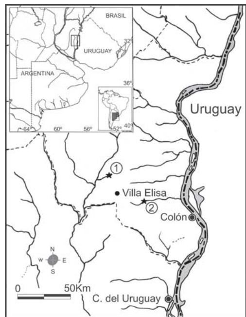
Fig. 1. Sampling localities of sigmodontine nests in eastern Entre Ríos province, Argentina: 1- Río Gualeguaychú and 2- Arroyo Perucho Verna.

Nests were attributed to H. brasiliensis whenever this species could be observed inside the constructions. Although Oligoryzomys nigripes and O. flavescens were captured using traps around nesting sites, presence of individuals inside nests was not observed directly. For this reason, hair was collected from the nests and the taxa identified based on the techniques described by Chehébar and Martín (1989). For this, hair were immersed in hydrogen peroxide during five minutes, then immersed in ether during the same lapse of time, dried under a lamp, and finally placed in glycerine on a slide. The structure of the hair medulla was then evaluated with an optic