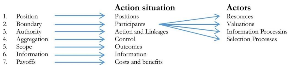
Figure 1. Relationship between rules-in-use and Elements of the Policy Action Arena. Source: Polski and Ostrom’s (1999: 39)