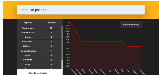
Fig. 2. The stage of obtaining keywords

After indicating the link to the website, a set of keywords and the frequency of their appearance on the website will be generated automatically (Fig. 2).