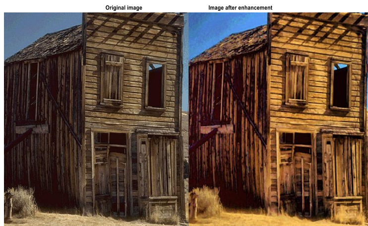
FIGURE 4. Original image versus Enhanced image (Bodie)

In Figure 3 the effective image details enhancement can be observed from the variation of color intensity of green grasses in different area, the roofing sheet rusty color and clearer presentation of details of wire fence at the bottom of the image this can also be observed in Figure 4 on clearer appearance of details of the whole plank house frame, the dimension of the planks use for support of the window by the side and blue color intensity of the sky.