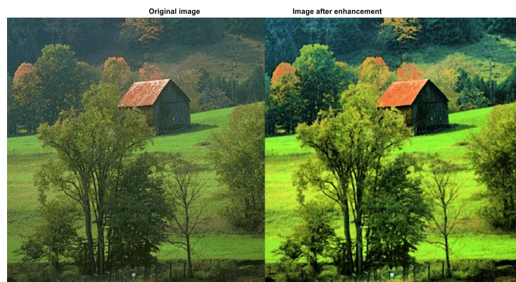
FIGURE 3. Original image versus Enhanced image (Barnfall)

Figures 3 and 4 shows two of the test images (Barnfall and Bodie (512 X 512 pixels)) obtained from the Computer Vision Database and the resulting outputs after enhancement using the proposed algorithm.