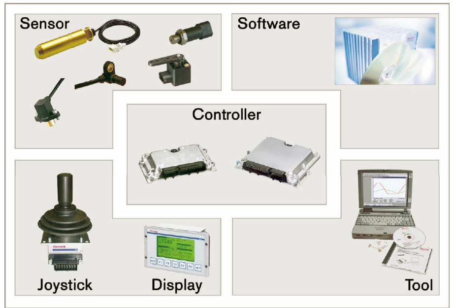
Fig.1. Microelectronic control system BODAS [1]

color display, with a full customization of the interface. It supports the connection of a camera for the operator to observe the work area of the machine. All devices can be connected to the controller, process input signals and control selected mechanical as well as hydraulic components of the drive system.