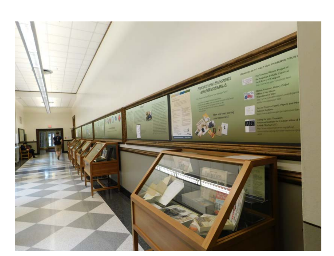
Stories of Service Library Guide: http://guides.library.illinois.edu/storiesofservice