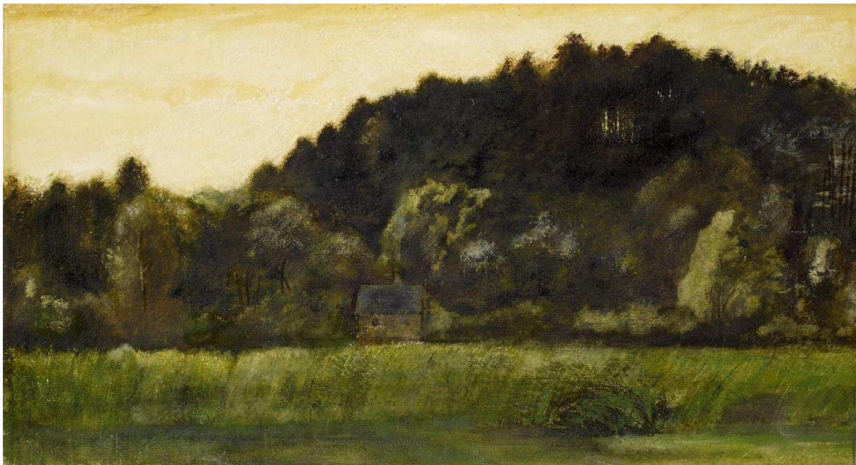
Figure 3. Edward Burne-Jones, Landscape—Study , 1863, watercolour and gouache with gum arabic, Birmingham Museum and Art Gallery Collection, 1954P62.