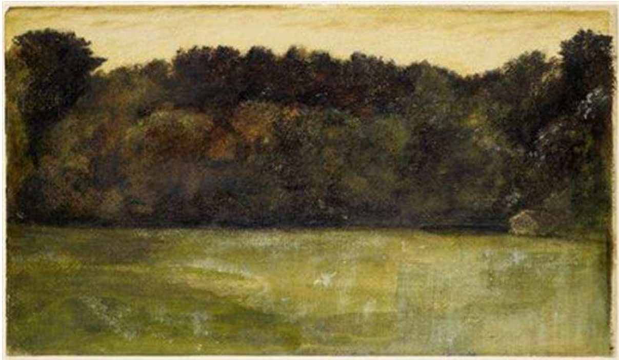
Figure 1. Edward Burne-Jones, Landscape—Study , 1863, watercolour and gouache with gum arabic, Birmingham Museum and Art Gallery Collection, 1954P61.

Are these images then simply incidental studies for either travel records or bigger pictures and larger conceptions, or are they instead a foot-hold providing key insight into what I am here calling his ‘supernaturalist’ approach to his vast and varied array of subjects and materials?