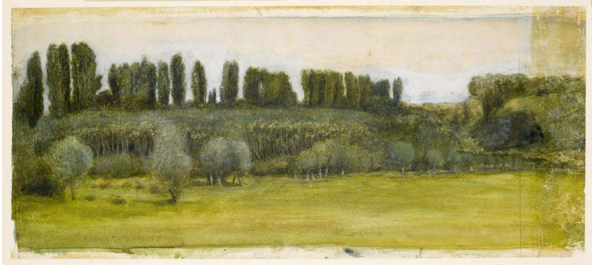
Figure 2. Edward Burne-Jones, Landscape—Study , 1863, watercolour and gouache with gum arabic, Birmingham Museum and Art Gallery Collection, 1954P60.