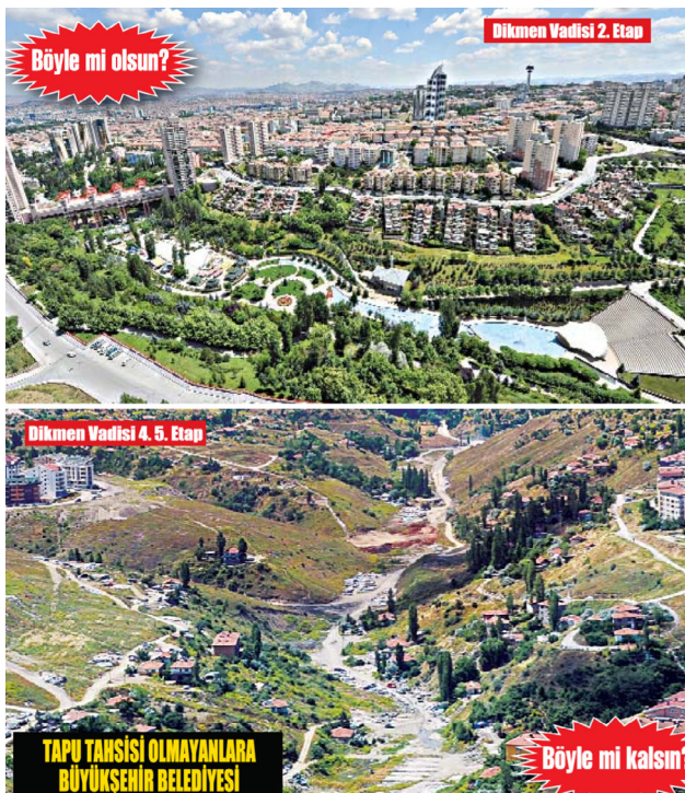
Figure 4: The cover page of the weekly Metropolitan Ankara bulletin dated 14–20 November 2011, demonstrating two photos of different parts of the Dikmen Valley urban transformation project area (public domain) [Colour figure can be viewed at wileyonlinelibrary.com ]

Stigmatisation of the insurgent was, thus, used as a political strategy to legitimise the transformation of the area as a tool for social order as well as modern urbanisation. This led to surfacing of fragmentation within the community revealed by competing political views (Özdemir and Eraydın 2017) concerning insurgence. Haydar (59), a current dweller and one of the leading figures in the struggle, told