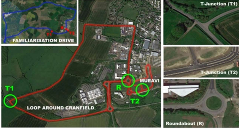
Figure 1: Study location.

loop around Cranfield and the MUEAVI (central quadrant) and the familiarisation drive (upper left quadrant). Participants drove the route different times continuously and therefore they made different manoeuvres on the different intersections situated on the driving route. The present study focuses on the drivers' risk perception of three intersections situated on the study location. These intersections are the roundabout R and the two T-junctions T1 and T2 shown in Fig. 1. The roundabout has three perpendicular legs and a diameter of 45 meters approximately. The T-junctions have the three legs perpendicular to each other and have similar dimensions. The analysis made regards the drivers' stress level during a crossing manoeuvre for each T-junction (manoeuvre 1 and manoeuvre 2) and during two crossings manoeuvres on the roundabout (manoeuvre 3 and manoeuvre 4). We chose to compare crossing manoeuvres, rather than turning right or turning left manoeuvres, because the speed for crossing manoeuvres is higher than for other manoeuvres. Since the final aim of the study was to evaluate how the type of intersection affects drivers' risk perception, we analysed only the manoeuvres where the traffic was not affecting the driving behaviour (no traffic or really low traffic at the intersection during the execution of the manoeuvres).