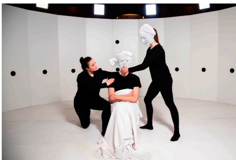
Figure 2. Christine Borland, Photosculpture, 2018.

Informed as “I say nothing” was by historical and contemporary sculptural precedents, Borland’s main inspiration nevertheless came from her research in the Glasgow Museums Resource Centre, exploring items in the collection related to World War One. Borland’s access to the Resource Centre was facilitated by the 14–18 NOW commission, and the prestige of the commission, and of Borland