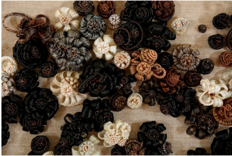
Figure 6. Cat Auburn, detail from “The Horses Stayed Behind”, 2015. Horsehair, copper, linen. Image courtesy of Cat Auburn.

This investment in the work by the community was a surprise to Auburn, but one that recalled the origins of hair wreath traditions: