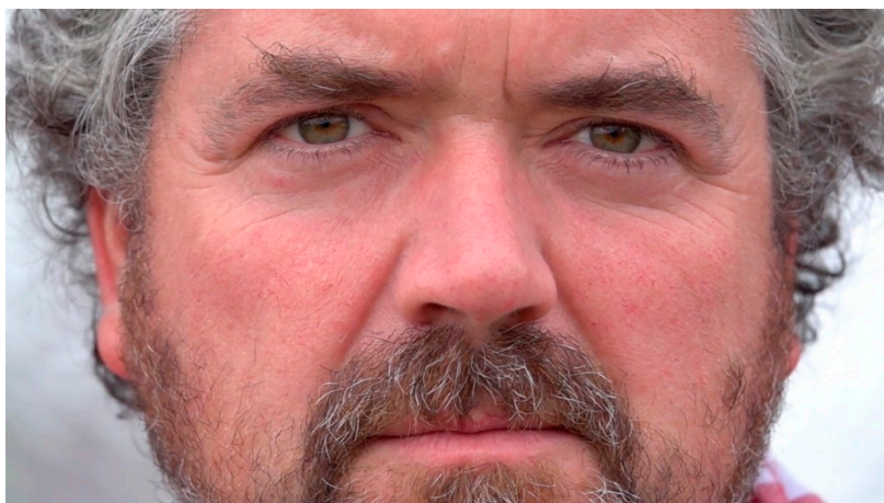
Figure 4. Dalziel + Scullion, still from “Sàl”, 2018.