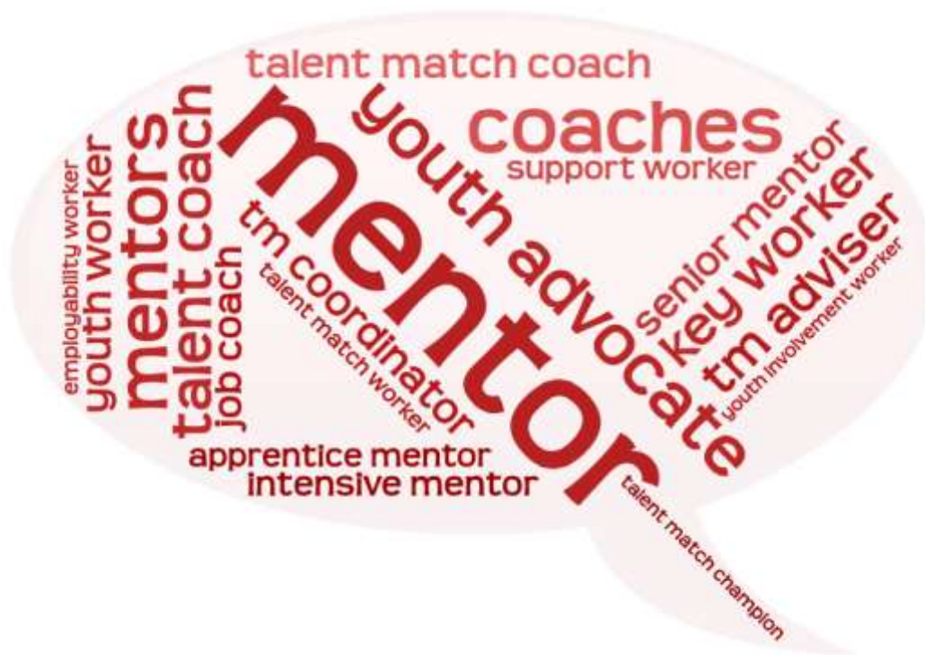
Figure 1: Terms used to describe key worker

A range of terms are used by TM partnerships to describe a key worker (see Figure 1), with mentor and advocate being the most frequently used terms.