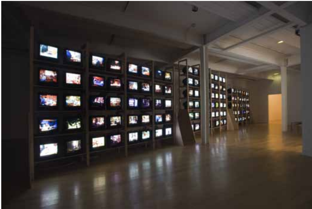
Solo scenes in The Fruitmarket Gallery, Dieter Roth (1998)