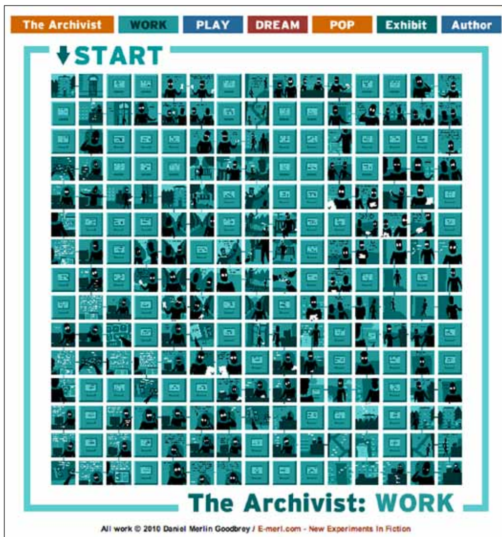
Goodbrey, D.M. (2010) The Archivist: Work .