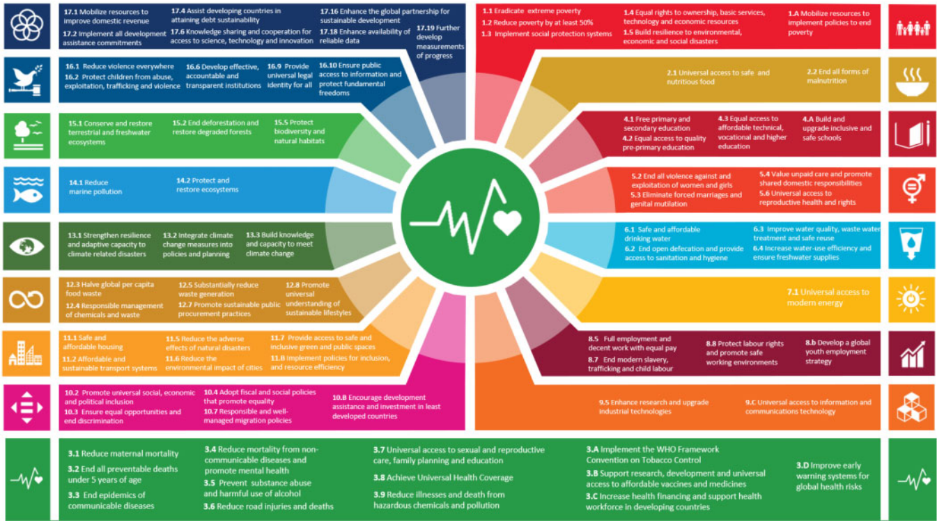
Figure 1 Health-related SDG targets (World Health Organization Regional Office for Europe, 2019)

immunization rates, tackling risk factors like obesity, alcohol, tobacco use and air pollution, addressing mental health disorders and reducing interpersonal violence. 3