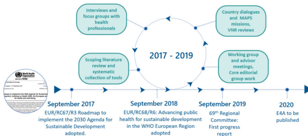
Figure 2 Timeline of the development of the E4A approach (World Health Organization Regional Office for Europe, 2019)

Development Group's SDG Acceleration Toolkit and the UN Development Programme's library was conducted, which returned ~800 tools. Two sets of criteria were then established for inclusion: (i) tools that were published in the last 5 years and (ii) tools that were deemed practical, useful for decision-making across different areas of health, supportive of actions and interventions to achieve SDGs and targets and that had the potential to accelerate implementation across the SDGs and targets. This resulted in a list of 400 tools, categorized by four WHO experts into (i) SDGs and target(s), (ii) the SDG Roadmap's strategic directions and enablers and (iii) stages of the policy cycle. Classification conflicts were resolved through consensus judgments. Third, in preparation of the first progress report on the implementation of the SDG Roadmap in 2019, 3 two additional reviews were undertaken on (i) SDG governance arrangements and health content as described in 43 Voluntary National Reviews (VNRs) conducted by WHO European Member States and (ii) the extent to which the actions taken in 20 countries, as described in their VNRs, align with the Roadmap's recommendations. 15 Fourth, an analysis on the status of each of the SDG 3 targets and on several other health-related SDG targets, their interconnectivity with other SDGs, available policy instruments, indicators and resources was conducted. 16,17